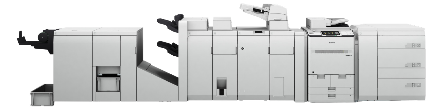
Typical applications of the imagePRESS C270 Series.